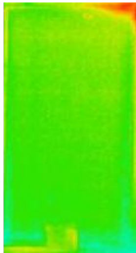
GreenBuilt R-10 Surface temp - 73°